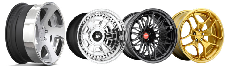
deep concave profile examples