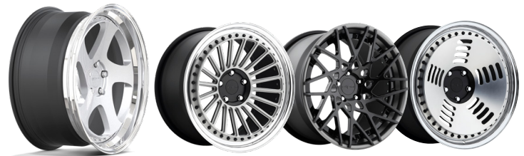
concave profile examples