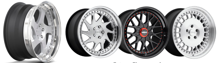
flat profile examples